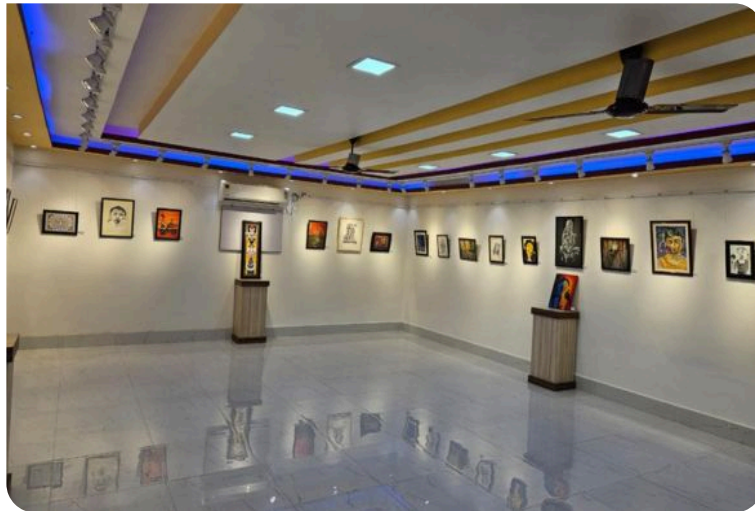
The newly constructed art gallery at Vivekananda College displaying paintings by students and teachers