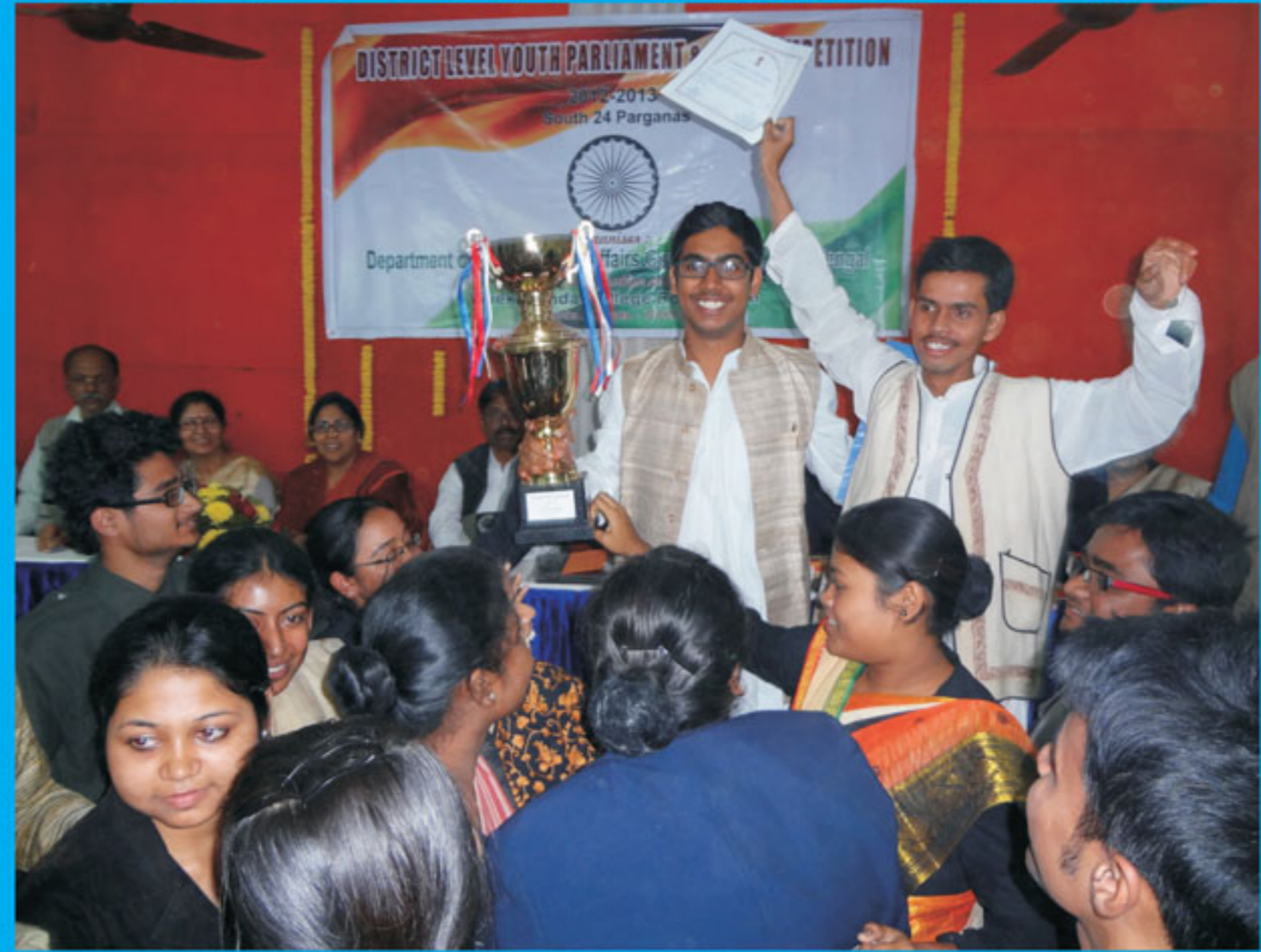
Moment of victory : Trophy reclaimed by Vivekananda college Thakurpukur