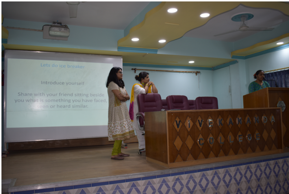
A session on Gender Stereotypes held on 27 th April 2019. A survey and questionnaire were discussed with the students.