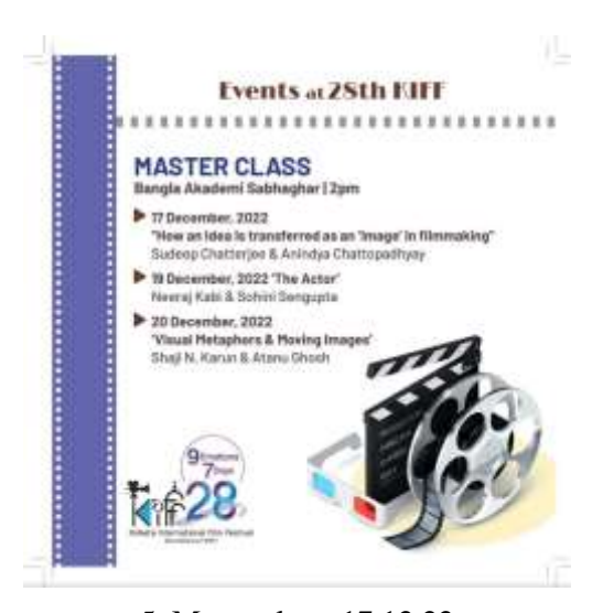
5. Masterclass, 17.12.22